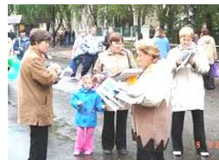
People ask for information about Falun Gong

Crowds of people were on the street throughout the event. The practitioners displayed banners in the city center, distributed information exposing the persecution, did the Falun Gong exercises, and made folded paper lotus flowers. They gave people the lotus flowers and Falun Gong truth-clarification materials to introduce them to Falun Gong.